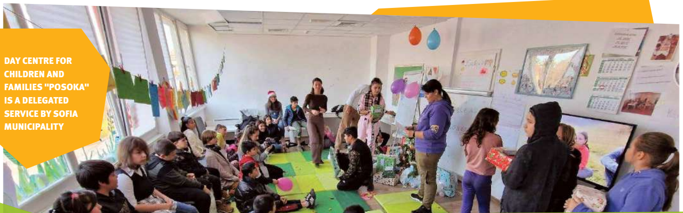
DAY CENTRE FOR CHILDREN AND FAMILIES "POSOKA" IS A DELEGATED SERVICE BY SOFIA MUNICIPALITY

In 2022, the children visiting the centre were able to enjoy many new experiences, some of them for the first time in their lives. We formed a Chess and Social Skills Club where, through the rules of this noble sport, children from different social groups have the opportunity to communicate with each other, learn more about themselves and other people. We organized discussions and watching films that concern important issues such as violence, aggression and bullying at school. With several sports activities such as our climbing program in the centre, outdoor climbing, a visit to an aqua park and even mountain hiking, we were able to encourage the children to believe more in themselves and show them that they can find solutions and overcome difficulties on their own in life.